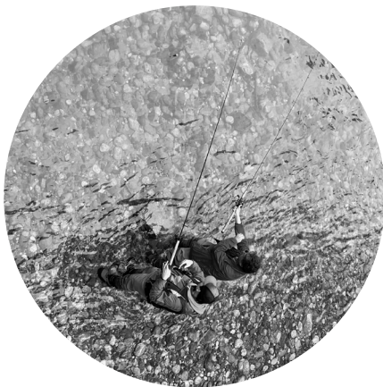
Fishermen of the Coquitlam River