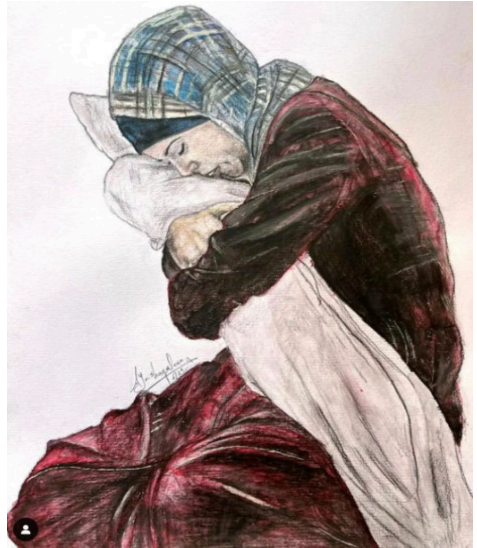
Art by: Aya Shaqalean