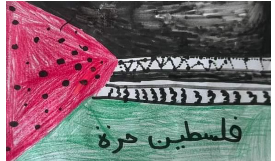
Art by: Lamees