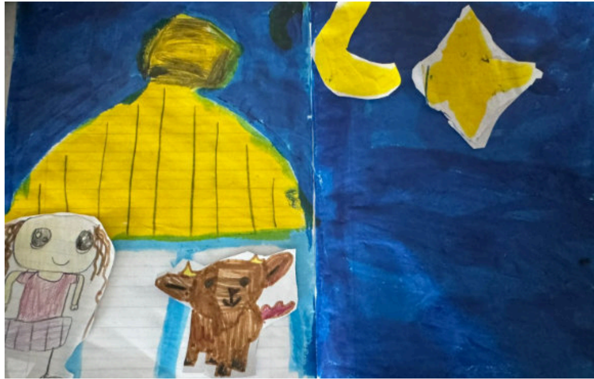
Art by: 7 year old of her visiting Jerusalem with her favourite animals.