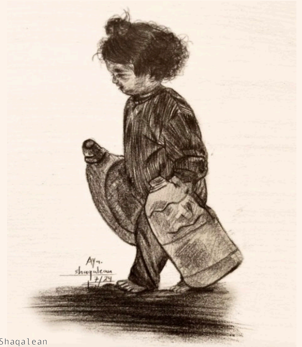
Art by: Aya Shaqalean